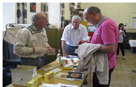
Information at the Eco Coffee morning

Helensburgh and Lomond held its second annual awareness raising coffee morning on Saturday 11 June. The event is intended to showcase what they have been doing locally and also to link groups with a common interest. The network was supported by three local Eco schools - Hermitage Primary, Cardross Primary