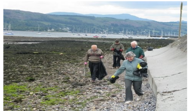
Hard at work on the beach at Helensburgh

cotton buds! Clearly too many people flush these away rather than disposing in the waste bin. It would be better to buy cotton buds with rolled paper sticks that degrade quickly!