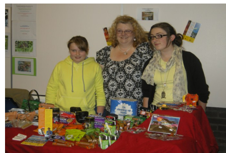
The Fair trade stall

Stirling network travelled to Aberfoyle to see the renovation project at St Mary's Episcopal Church. The project cost £310,000 with funding from insurance, Heritage Lottery, a VAT refund, an Episcopal Church grant and fundraising from the congregation and local community. Many items had been renovated, including new felt under existing tiles adding to energy efficiency for the building. They are now considering air source heat pumps to replace electric heating. The next meeting is on 22nd November, 7.30pm in Stirling Methodist Church.