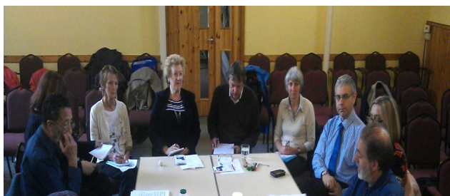
Discussions at the local networks seminar

That's why, as the Board reflected on what next for the movement, it did not do so simply at its own meetings but set up what will be the first of several local network meetings. Seven of our 12 (and soon to be 14) networks met in Stirling earlier this month to discuss the development of Eco-Congregation Scotland. The notes of the meeting can be found here. http://gh.cm/nhafop