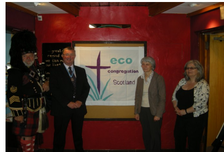
Opening the Green Day Out event

They meet again on Tuesday 4th October at St John's Church in Hamilton when there will be a review of the Green Day Out event and an opportunity to share stories and learn from each other's eco-congregation work.