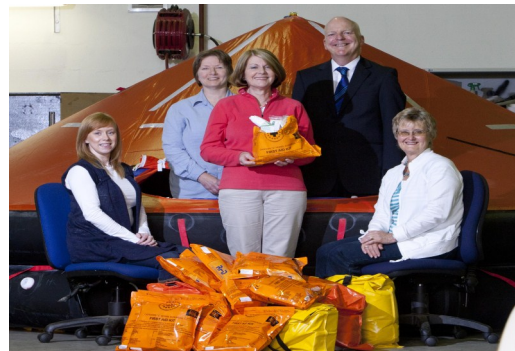
Cosalt Offshore receiving the first aid kits

Skene Parish and Trinity Westhill has an eco group which functions well bringing other individuals and groups in. It has pioneered an innovative scheme to recycle first aid kits from maritime life boats, which has the potential to be replicated in other areas. The church has access to all the first aid kits from Aberdeen but other ports may be able to make links with similar churches. See http://www.skeneparish.com/eco-congregation-group.html