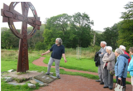
The Glebe Project at Luss

The Network's supporters followed up this event on the Sunday afternoon with a beach clean (see News item on p 2 and met again on 2nd September to see the amazing work at Luss Parish Church. See http://tinyurl.com/3go5pxu