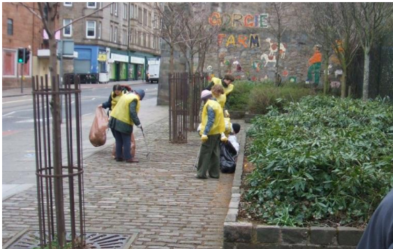
Work at Gorgie to clean up a local green space

etc in the green-space opposite the church (in partnership with Gorgie City Farm).