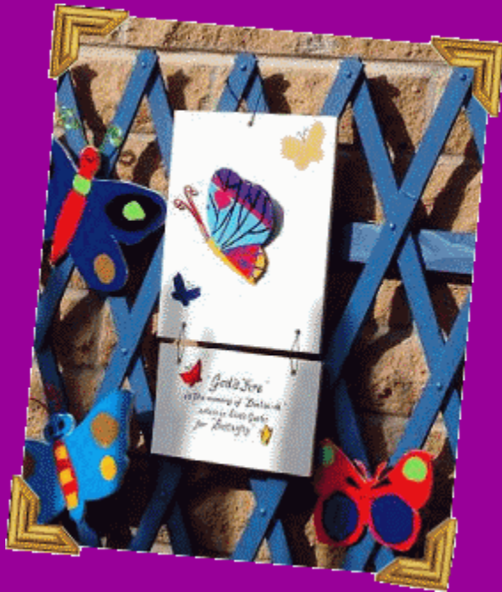
Knightsridge Local Ecumenical Partnership