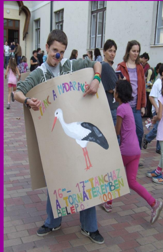
Hungarian Church Climate School