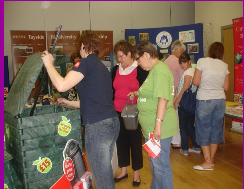
Arbroath Old and Abbey Church