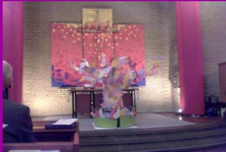
Abbotsford Church, Clydebank