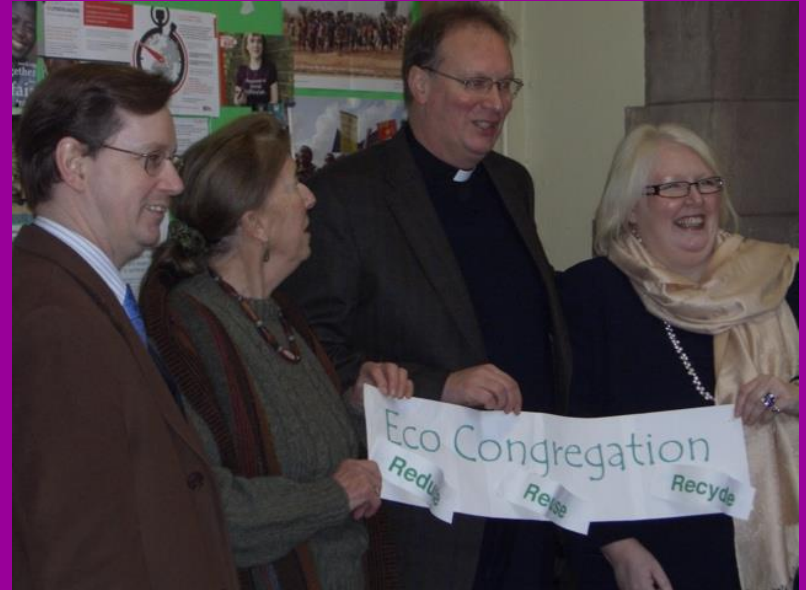
St Ninian's Cathedral, Perth