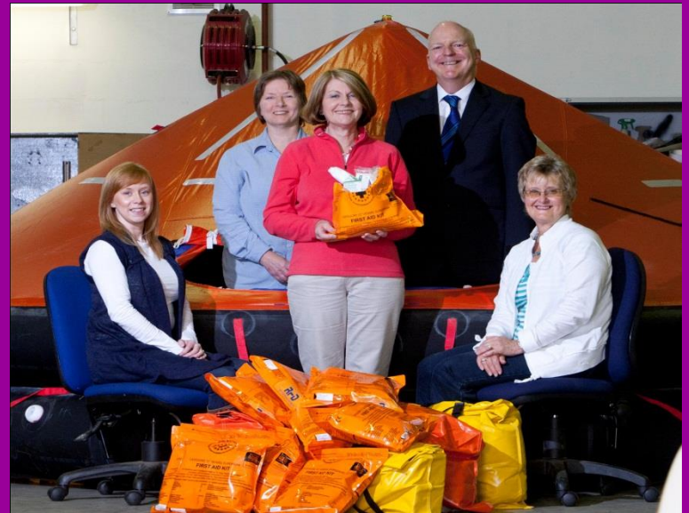
Skene Parish Church