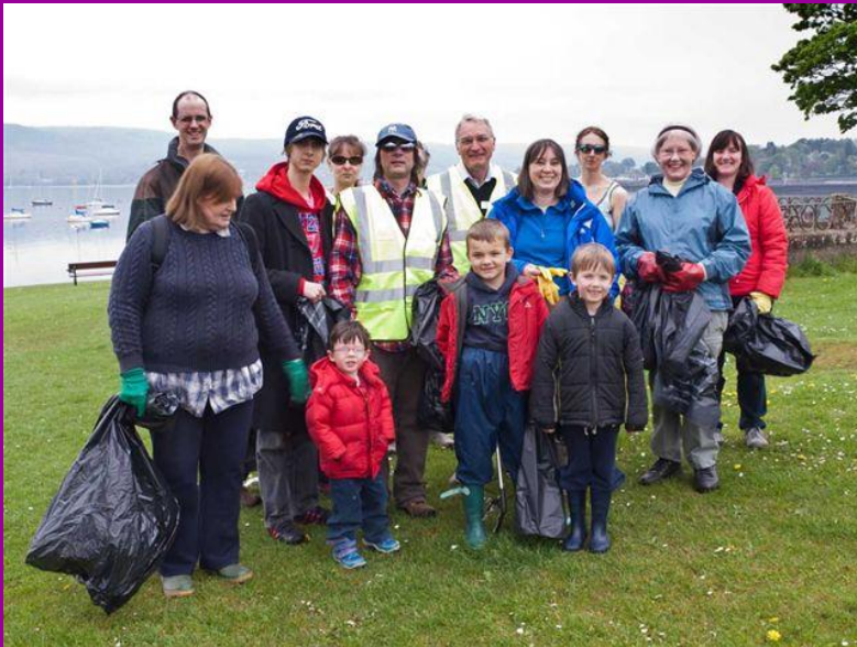
Helensburgh Beach Clean