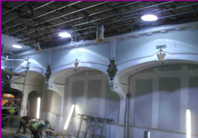
Sacred Heart RC Church, Edinburgh