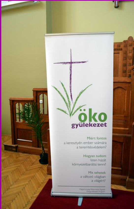
Ökogyülekezet , Hungary