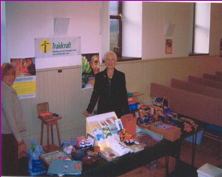
Jamestown Parish Church