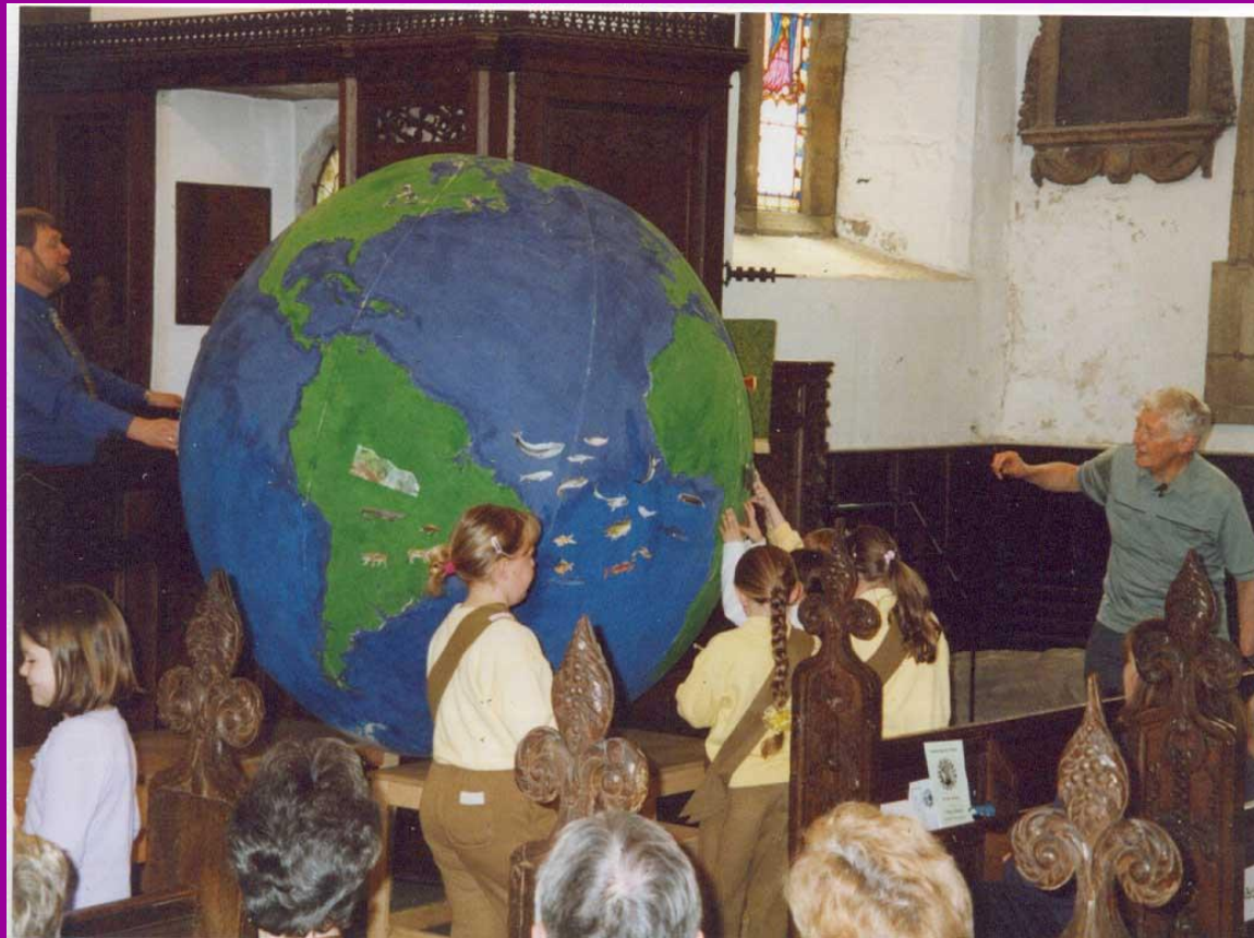
Dalbeattie Parish Church