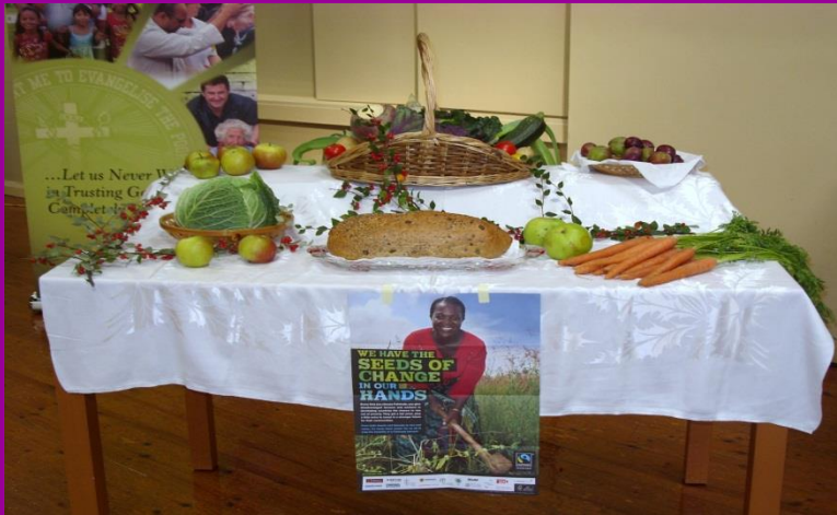
St John Ogilvie's RC Church, Edinburgh