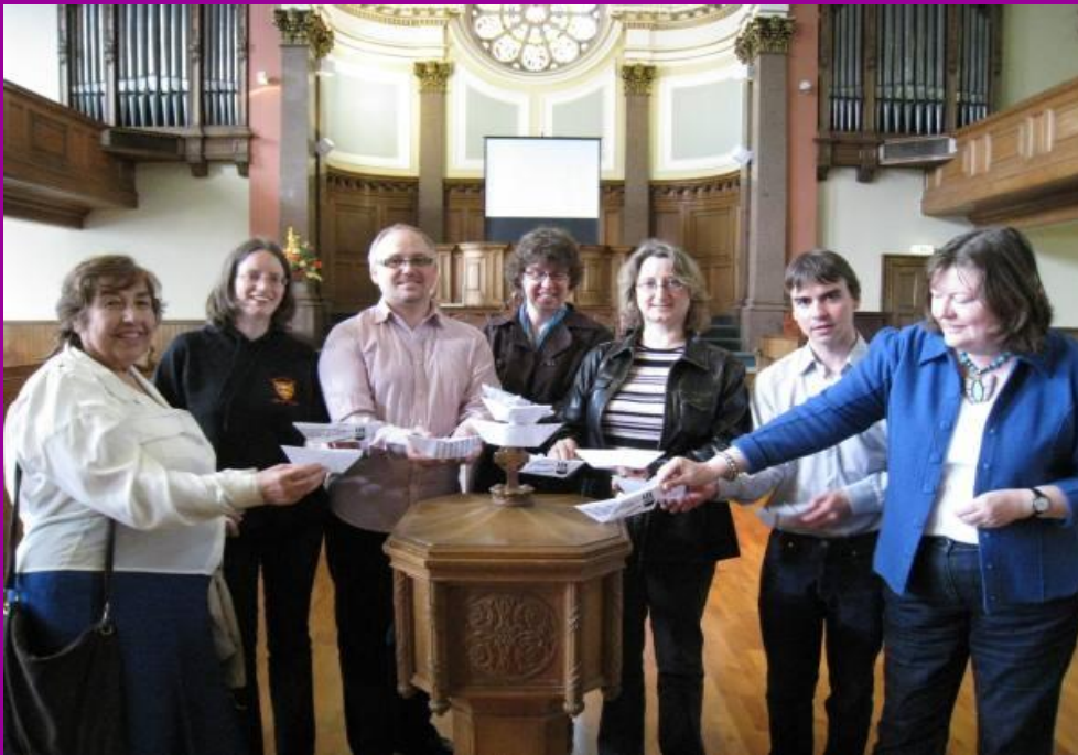
St John's Episcopal Church, Edinburgh