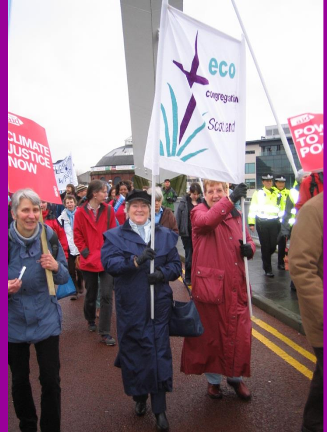
The Wave March, Glasgow